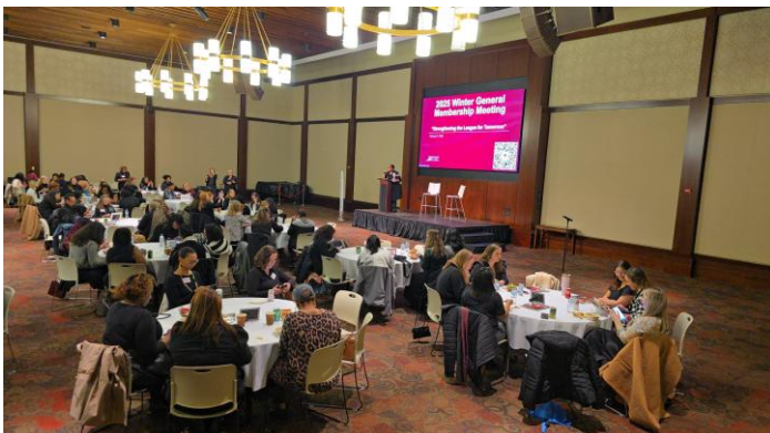
Winter General Membership Meeting