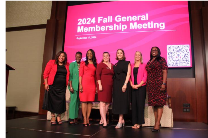
Fall General Membership Meeting Panel

Our training programs are presented in a variety of formats, both informal and formal. Members gain experiential training through their volunteer roles each year, serving in both internal and external capacities. This year, training programs were offered through three General Membership Meetings (GMM); Fundamentals (one-day programs); the JLA Leadership Institute (a course series consisting of multiple classes on a single topic of focus); and two Leadership Retreats.